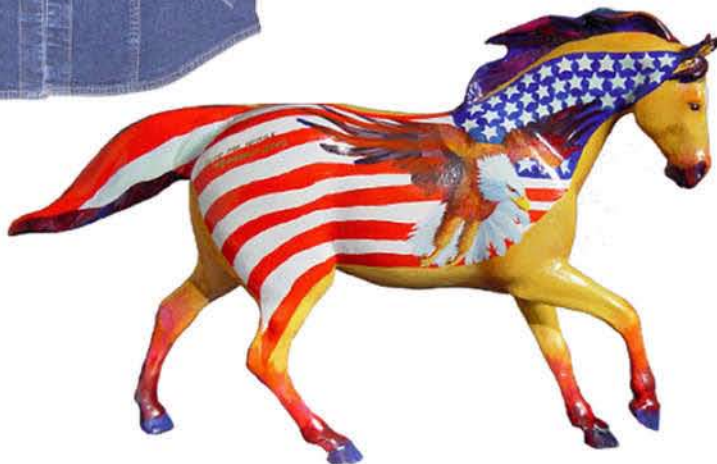
Give Me Wings

Show your Patriotic Pride and the Cowgirl in you when you wear this denim shirt that showcases the artwork "Give Me Wings," which was inspired by a poem written after the events of September 11th.