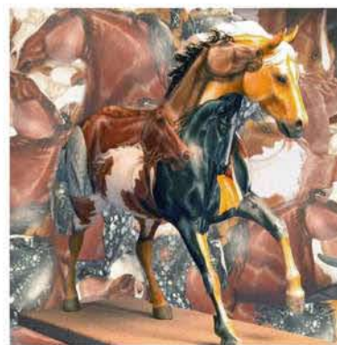
Year of the Horse