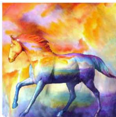
Renewal of Life